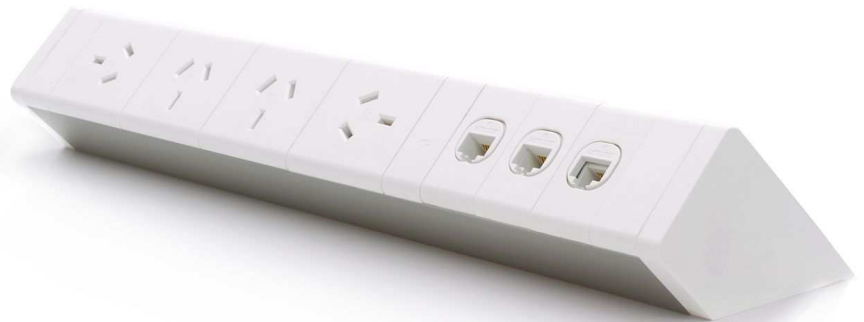
A04R0310DWT Shown (Data jacks not included)