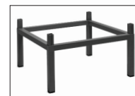
Table Extender *Optional