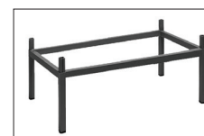
Table Extender *Optional