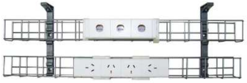
2 Tier shown with WGCD & WGCB Clips, GPO & Data tiles (not included)

CMS have now released a new 50mm flexible cable management basket with two new vertical mounting brackets, which allows the installer to switch between a two tier basket to a single tier basket.