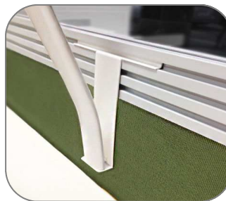
Slat wall mounting