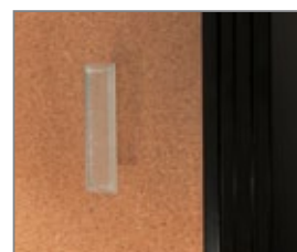
3mm safety glass with grooved finger slots for easy opening