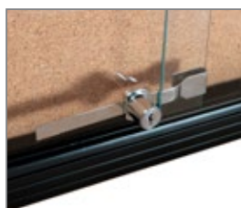
Self fitting lock and key