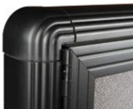
Black frame has rounded corners.