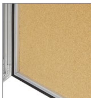
Internal rubber gasket helps prevent moisture and dust inside cabinet