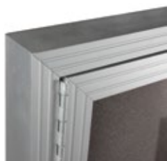
Silver frame has MITRED corners