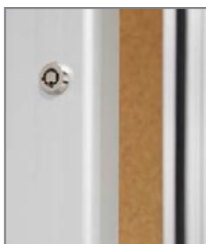
Anti tamper style and lockable