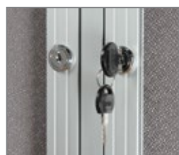
Lockable security doors