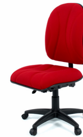
Standard base no arms