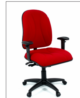
Standard base with adj arms