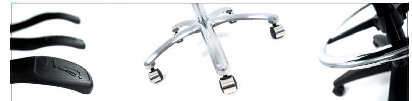
3 Lever Mechanism