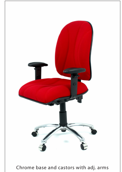
Chrome base and castors with adj. arms