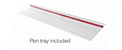
Pen tray included